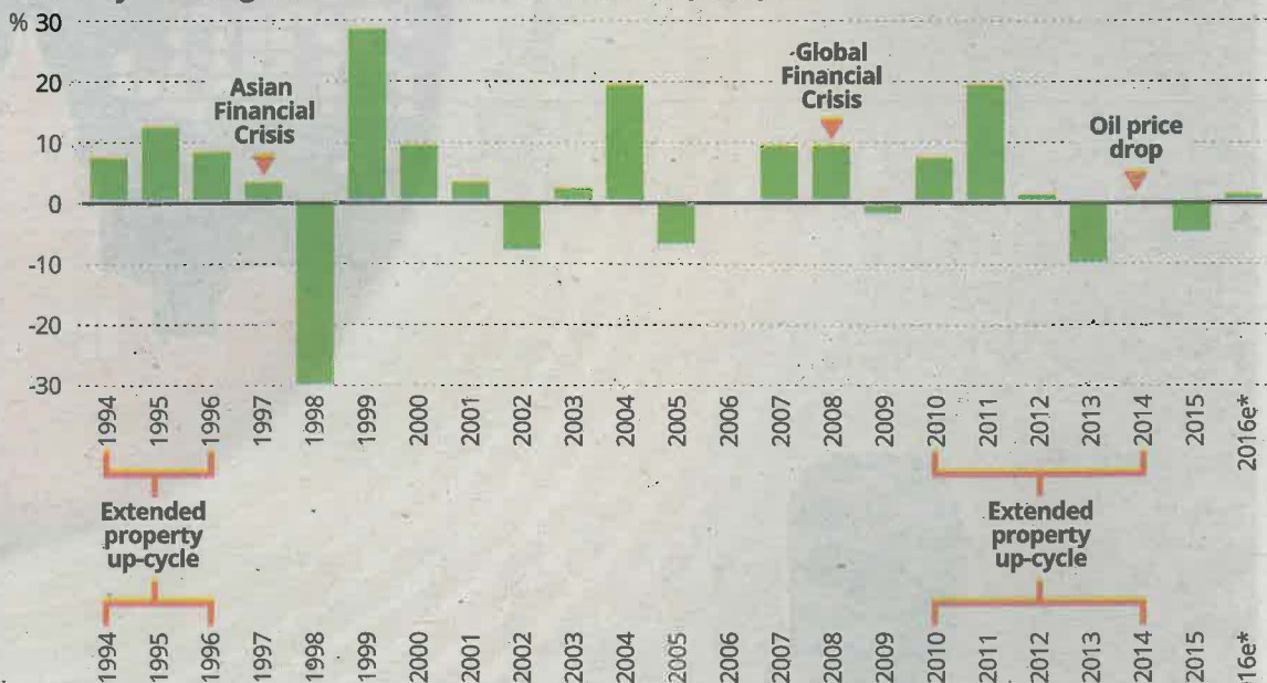
Year-on-year change: Residential transaction values (RM mil)