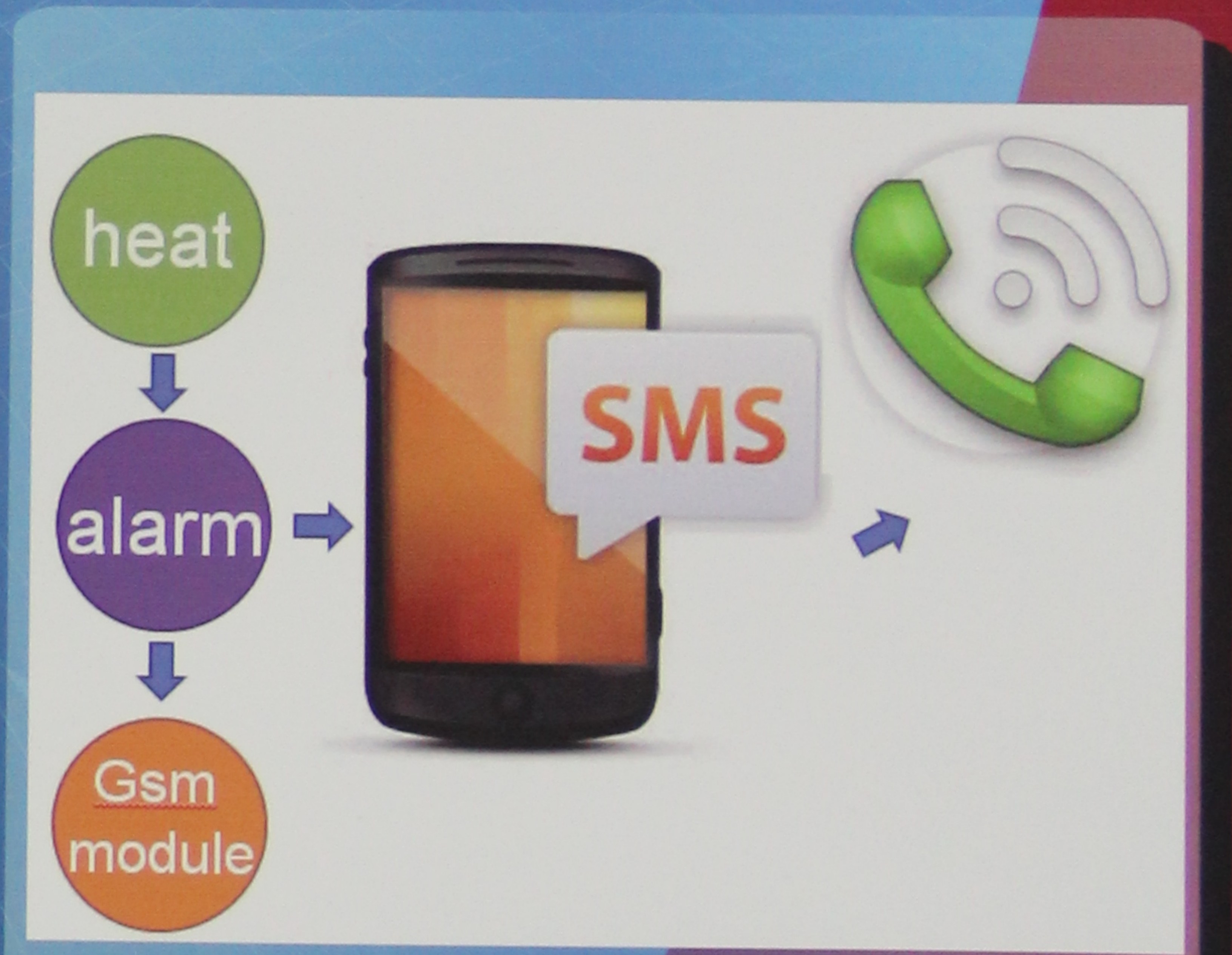
Process of system

Jabatan Bomba dan Penyelamat Negeri Perlis