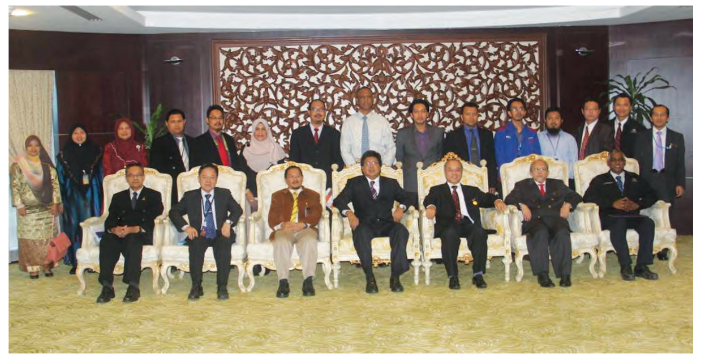
Group photo during the MoU Signing Ceremony