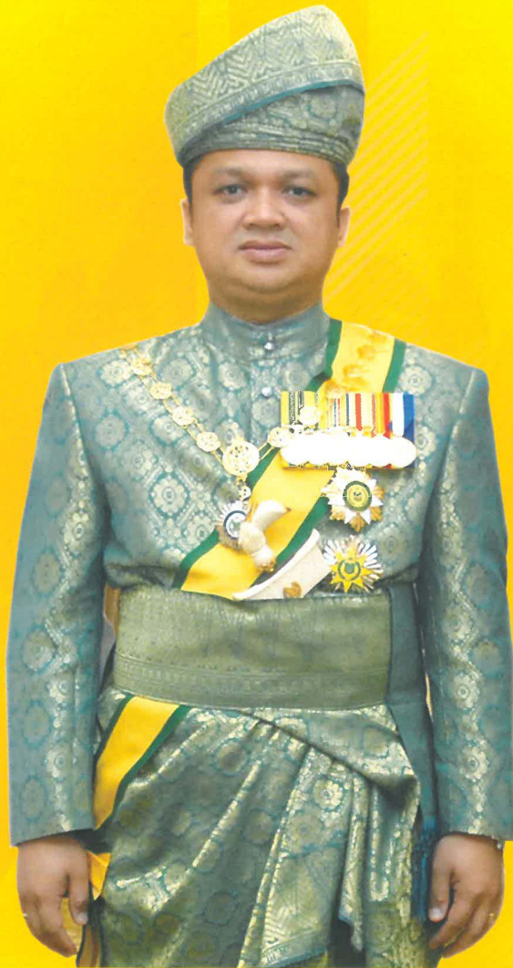
DULI YANG TERAMAT MULIA TUANKU SYED FAIZUDDIN PUTRA IBNI TUANKU SYED SIRAJUDDIN JAMALULLAIL D.K., S.P.M.P, P.A.T Doctor of Education (Honoris Causa) La Trobe University Melbourne Australia