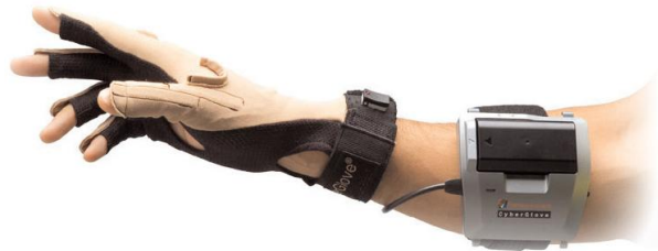
Fig. 2: Cyber Glove II (Immersion Inc.)

Additionally, dataglove is likewise utilized within the study of hand rehabilitation by combining together with a VR system (Wang Junhua, 2010) and head mounted display (HMD). It has various sensors which accurately give the orientation of bending fingers and the whole hand as well as position of the fingers. Magnetic resonance sensors are placed at the fingertips of the gloves for the positioning purpose. Software on the computer takes the relative orientation of the fingers in space given by the sensor and maps it on to a simulated hand. The rotation and orientation of the hand is captured by other sensors like accelerometers and gyroscopes and integrated with other positional information. The bending of the fingers is sensed by a technique by using optical sensors which can tell how much a finger is bent by the amount of light reaching it through an optical fiber. The more the finger is bent, the more the light through the fiber is restricted and hence gives an indication of the amount of bend.