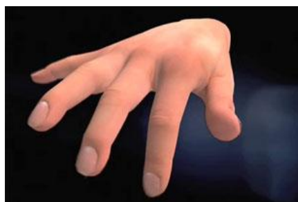
Fig. 3: Virtual reality hand for virtual activities

The application of VR in physical therapy has concentrated mainly on the post-stroke patients. Fewer effort has focused patients with musculo-skeletal deficits, depending on whether from surgery, fractures or arthritis (Sveistrup H et al. , 2003). VR handles the requirements of sub-acute musculo-skeletal training by offering virtual activities intended to motivate and employ the patients in a time of intensive physical activity (Forducey et al. , 2005) as illustrated in fig. 3.