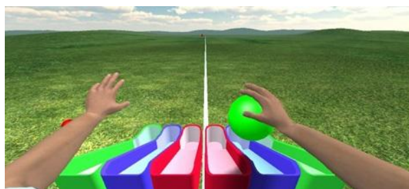
Fig. 5: Placing Game. Rehabilitation training task combining reaching and grasping exercises

Since this project needs to do the virtual rehabilitation, software that is suits is Quest3D software which is a platform for VR system for virtual hand. Quest3D is software for developing real-time 3D Microsoft Windows applications. It’s consists of only a few high level software tools and almost all tasks are performed identical to the hardware. By using the software development kit, users can build their own components for Quest3D and build support for specific hardware such as dataglove. The Virtual Reality Peripheral Network (VRPN) will be used to interfaced the dataglove with VR enviroment and HMD. VRPN is a zero cost, open source tool that can handles many VR devices.