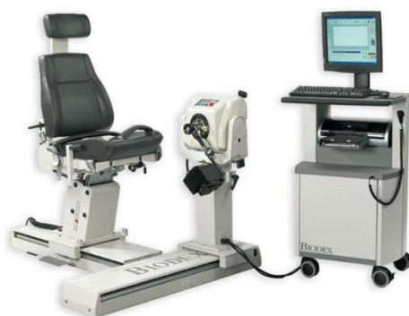
Fig. 4: Biodex System 4 Pro

In recent times, specialist manufactures in oversea have previously offered a line of multi-functional rehabilitation devices (Chen Hao et al. , 2010). For instance, the Proxomed Corporation in Germany has designed a Compass for medical related application in neuro-rehabilitation and orthopedic as well as in sports medicine and geriatric. Hocoma a Switzerland Manufacturers has offered a computerized robotic gait evaluation and training system which can be used for robotic treadmill training of patients with movement troubles (Chen Hao et al. , 2010). The solution of Biodex USA is a Multi-joint System 4 as shown in Fig. 4, an adaptable ergometer that suits the requirements of wellness, sports medicine, cardiac, orthopedic rehabilitation, or general conditioning program. Each one of these devices focuses the complete process from training the patients and assessment. Furthermore, many highly developed technologies in other areas can be applied for rehabilitation training such as 3D motion image capture system and VR technology. It is actually designed for special effects of entertainment or film and motion analysis, but additionally can be used in the gait analysis (Wang Junhua, 2010).