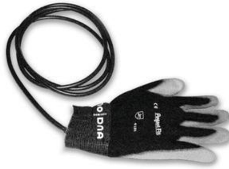
Fig. 1: X-IST CyberGlove made by Immersion Corp.

Additionally, dataglove is likewise utilized within the study of hand rehabilitation by combining together with a VR system (Wang Junhua, 2010) and head mounted display (HMD). It has various sensors which accurately give the orientation of bending fingers and the whole hand as well as position of the fingers. Magnetic resonance sensors are placed at the fingertips of the gloves for the positioning purpose. Software on the computer takes the relative orientation of the fingers in space given by the sensor and maps it on to a simulated hand. The rotation and orientation of the hand is captured by other sensors like accelerometers and gyroscopes and integrated with other positional information. The bending of the fingers is sensed by a technique by using optical sensors which can tell how much a finger is bent by the amount of light reaching it through an optical fiber. The more the finger is bent, the more the light through the fiber is restricted and hence gives an indication of the amount of bend.