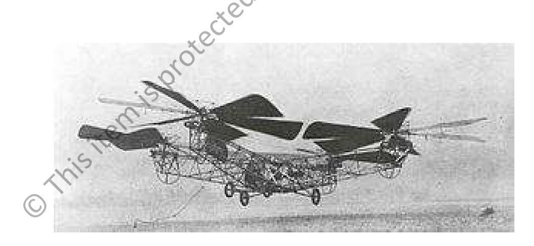
Figure 2.1: De Bothezat quadrotor, 1923