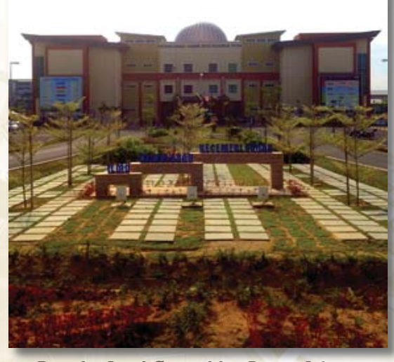
Juanku Syed Faizuddin Putra Library, Universiti Malaysia Perlis