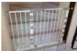
Prevent your toddlers from climbing up the stairs unsupervised by installing a child safety gate

Obviously for each age group, there will be different safety needs. For instance, toddlers would require extra attention at the high risk areas such as kitchen, storeroom (where you keep your hardware and household chemicals), bathroom, stairs and pinch-points prone places (drawers, doors, etc.). More importantly, you need to ensure toddlers and children stay away from the porch where you would usually park your vehicle!