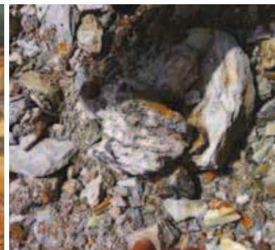
Sample of rock found at pit area