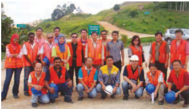
Participants at the visit

At the processing facilities, there is a room where the gold is processed into raw gold bars. In this room, a furnace is used to melt gold at a temperature of around 1200°C. Gold is melted in bulk in holding crucibles. Here, the gold bar is only about 85% pure. Further refining is done overseas as the plant does not have the capability to refine pure gold. The IEM participants were unable to witness this activity as no melting process was done on that day.