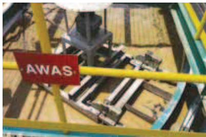
Cyanide solution processing tank

To extract the gold from the cyanide solution, carbon particles are added into the processing tank. The heavier carbon with gold particles is separated from the solution using a hydrocyclone. After that, the concentrated solution is ready to be melted to form a gold bar. The remaining solution is treated properly in huge retention ponds before the water is released back to the river.