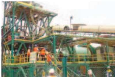
A view of the processing facilities

At the processing facilities, there is a room where the gold is processed into raw gold bars. In this room, a furnace is used to melt gold at a temperature of around 1200°C. Gold is melted in bulk in holding crucibles. Here, the gold bar is only about 85% pure. Further refining is done overseas as the plant does not have the capability to refine pure gold. The IEM participants were unable to witness this activity as no melting process was done on that day.