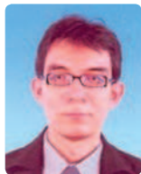
by Ir. Abdul Aziz bin Salim

PROCESS safety's main objective is basically to prevent fires, explosions and accidental chemical releases in chemical process facilities or other facilities dealing with hazardous materials such as refineries, and oil and gas (onshore and offshore) production installations.