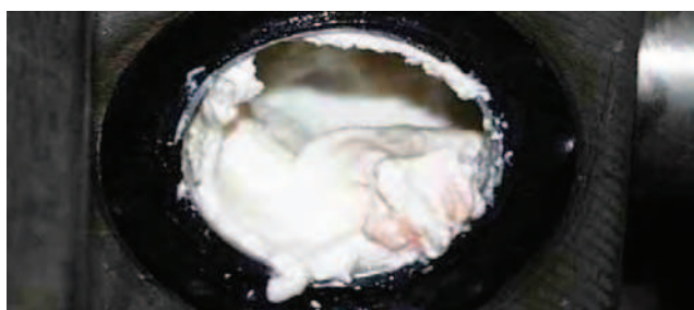
Figure 1: Fouling deposit of fresh milk after pasteurisation

The deposition of dissolved or suspended material or the growth of biological organisms is commonly found in fluids involved in heat exchange. This may generate the accumulation of unwanted deposits on the surface of the heat exchanger, known as the fouling deposit. Figure 1 shows the fouling deposit of fresh milk after pasteurisation.