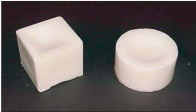
Figure 2. Palm Oil Wax.