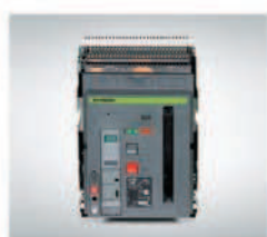
Air Circuit Breaker