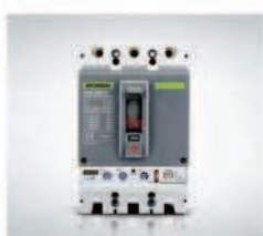
Molded Case Circuit Breaker