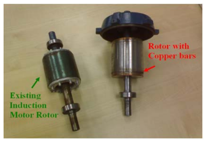
Fig. 3: Copper Rotor of Induction Motor after Milling Process.

This machine needs to be set-up by inserting the AutoCAD drawing into the EDM control panel. After initializing the rotor drawings the route of the wire is assign by the operator in which the wire will cut based on the assigned route. Then as these procedures are finish, the rotor is then milled to have a smooth surfaced as shown in Figure 3. The rotor is then inserted into the existing motor shaft. Based on Figure 4 this rotor is then assembled into the stator and laboratory experimental test is performed such as the no load, DC Resistance and block rotor test to obtain the motors efficiency and losses at 0.5HP rated current (1.07A).