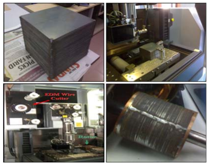
Fig. 2: Copper Rotor Fabrication Procedures.

Total 192 pieces of laminations sheets is stacked and wielded together on side and in the middle to form the rotor body based on Figure 2(a). A plunger is use to compress the copper powder into the rotor slot with force of 3-4 tons using the pressing station. The pressing station which consists of hydraulic press could apply a maximum force of 10 tons. Melting is the process of hardening the copper to form the rotor slot. The furnace is use to bake the copper for hours straight. At the beginning of the baking process the temperature is set at 200°C for 2 hours. Next step is baking the copper at the temperature of 900°C for 5 hours. Finally the baking process is to be cooled down for another 2 hours. The process is very dangerous as it deals with very high temperature and cost and it may cause health problem due to copper heating. As the rotor bars are copper, 2 copper end rings are sliced and joined with the copper rotor before the pouring of melted copper. Before the argon gas can be supplied to the furnace, the pressure gauge and flow meter is installed to the tank of the argon gas. Water filled with soap is sprayed along the tube and joints to make sure that the argon gas will not leaked during the purging process. The final process is by using the EDM wire cuter machine shown in Figure 2.